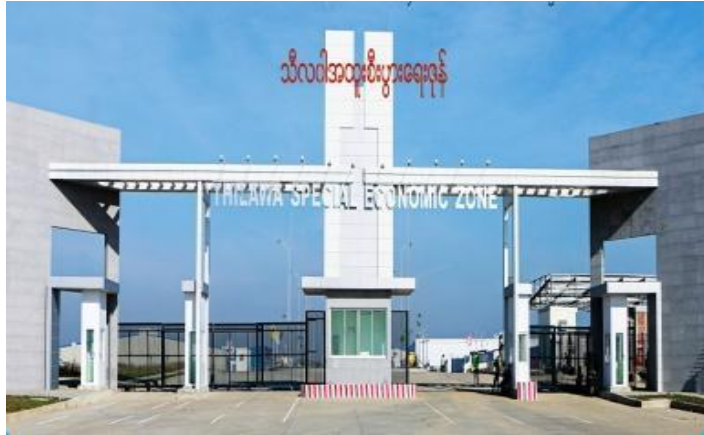
Photo of Thilawa SEZ